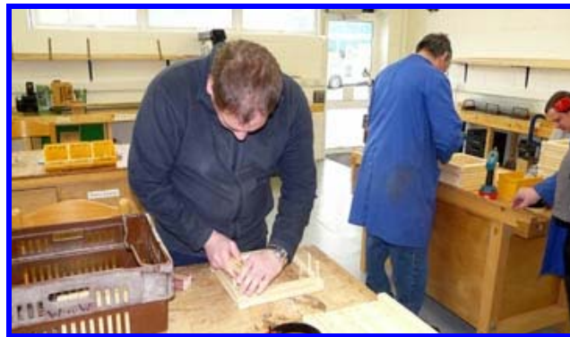
Wood n Ware