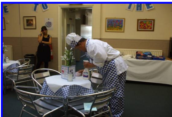
The Check in Cafe