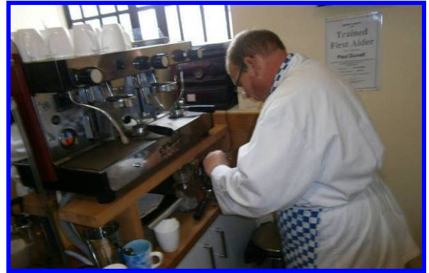
Nolan's Table cafe