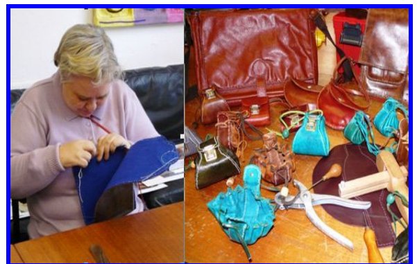
Wood and leather Craft